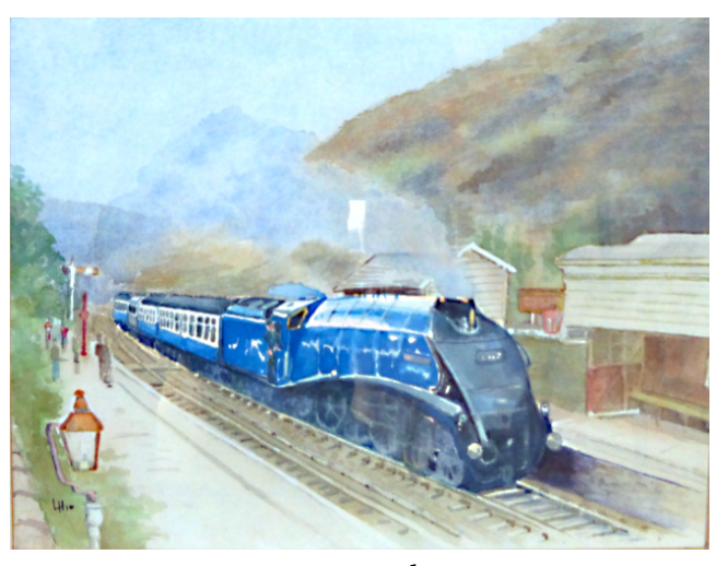
2 Len Hodge