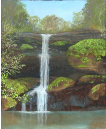
1 Ian Forman