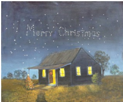
1 Ian Forman