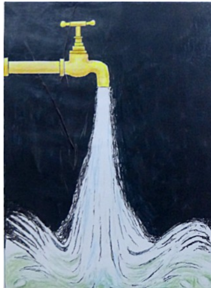
1 Bert Griffin