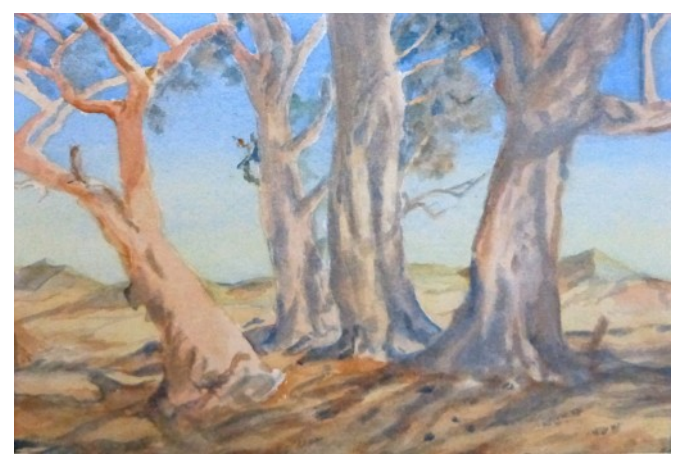
3 Len Hodge