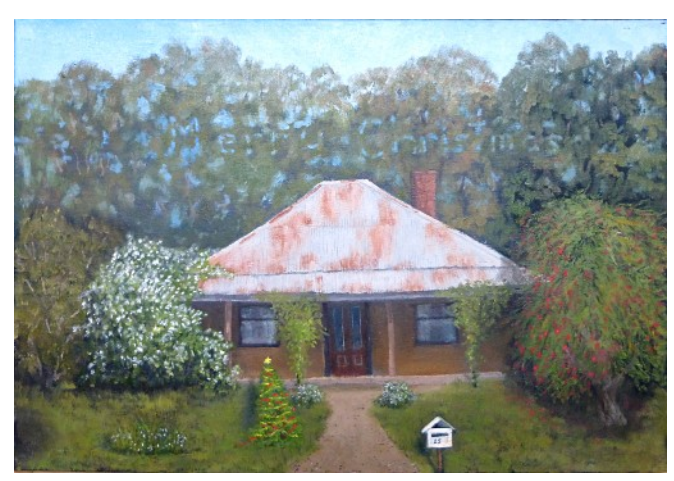
2 Ian Forman