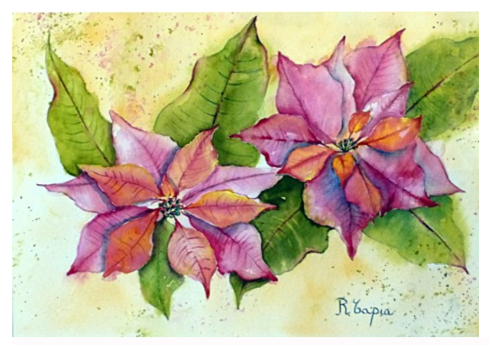
1 Raquel Tapia