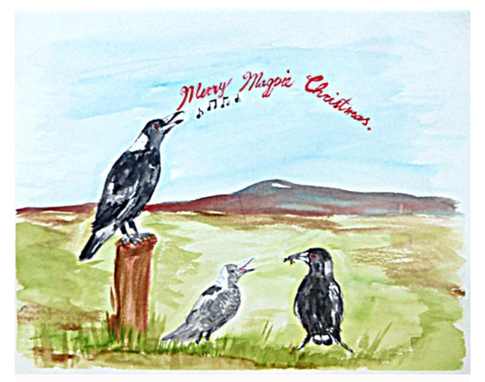
1 Lou Murray