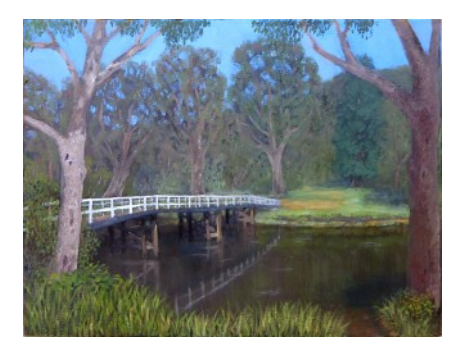
2 Ian Forman