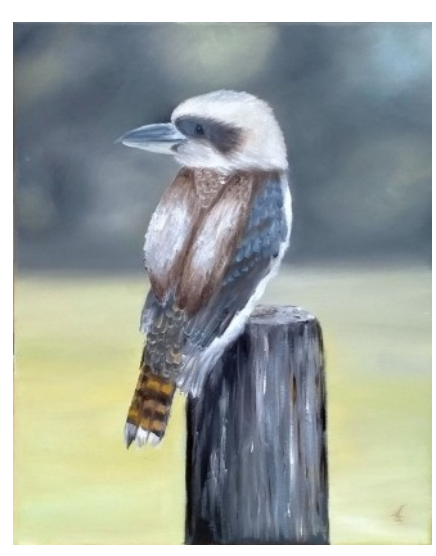
1 Angela Delli-Pizzi