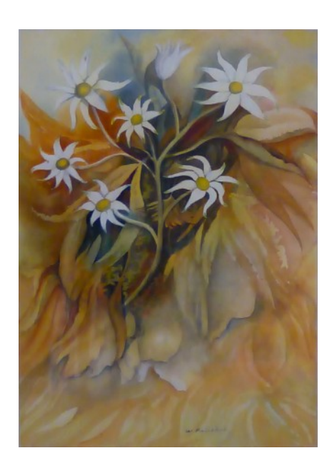
1 Wendy Faulkes