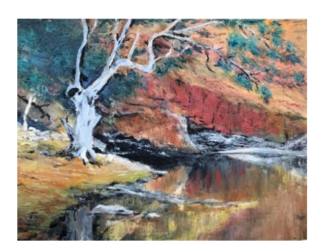
3 Ian Forman