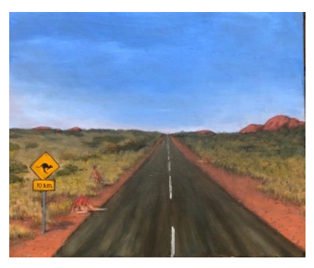
2 Len Hodge