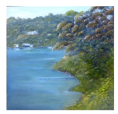
1 Angela Delli-Pizzi