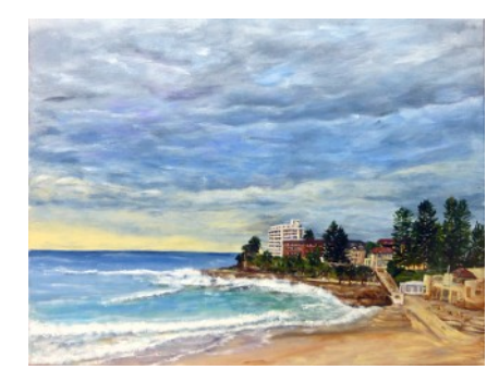
3 Lou Murray