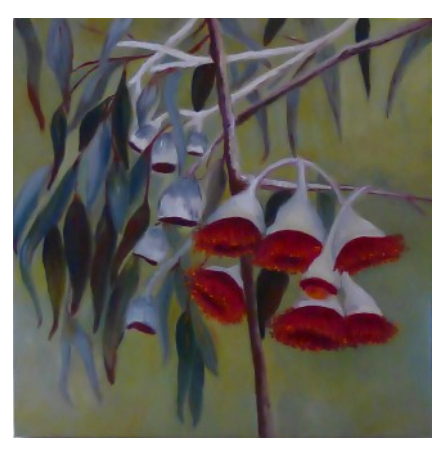
2 Myriam Pulgar