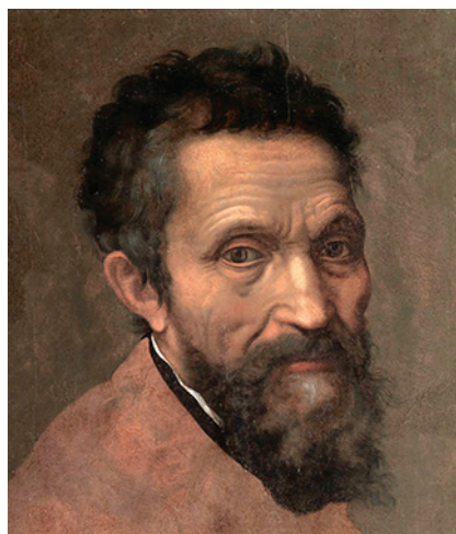
Michelangelo by Daniele da Volterra

As a painter he is best known as the creator of the ceiling and the Last Judgement in The Sistine