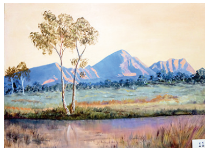
1 Beverley Theodore