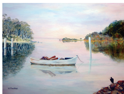
3 Wendy Faulkes