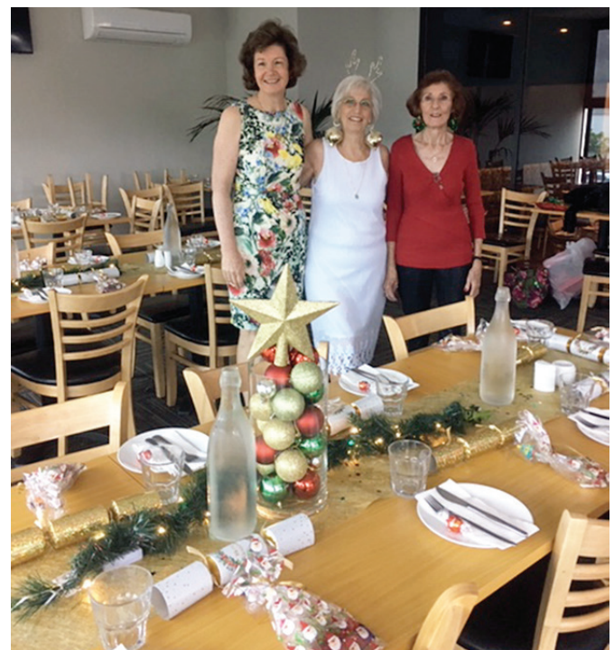
Christmas Party 2018 at Engadine RSL