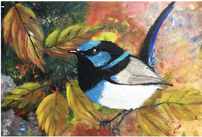
Rob Jordan • Blue Wren

Showcasing member's creativity during the recent lockdown.