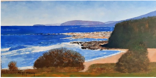
Cliff Penney • Pretty Beach, acrylic