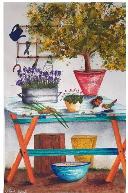
Carolynne Martin • Potting Table