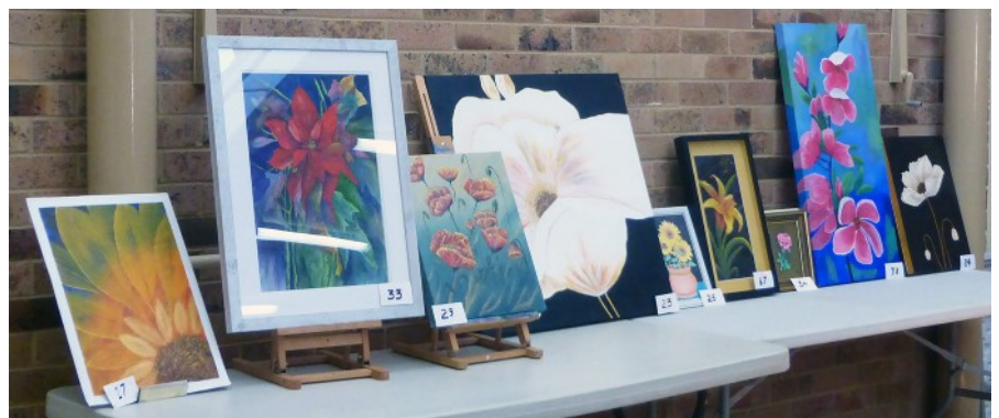
A selection of November Oeople's Choice submissions