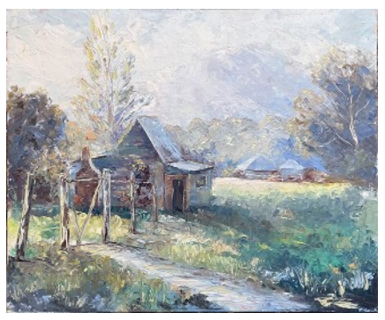
1 Yvonne Biggs