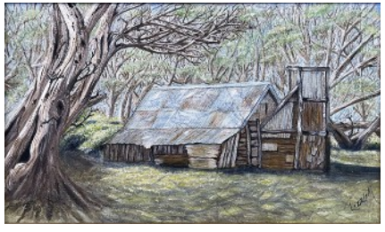
3 Elizabeth Rocha

July 7 : Sally Walsh—Watercolour • Peoples Choice—Table Scene August 4 : Pamela Griffith • Peoples Choice—Lily Pond