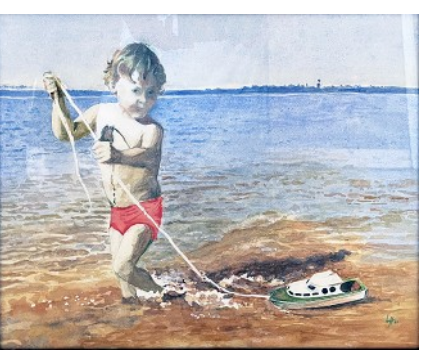
3 Len Hodge