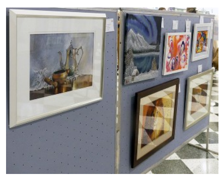
Sutherland Shire Art Society - www.shireart.com