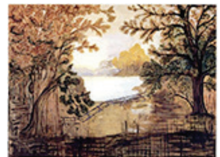
Fireboard decorated by Moses in 1918