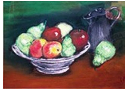
2 Len Hodge