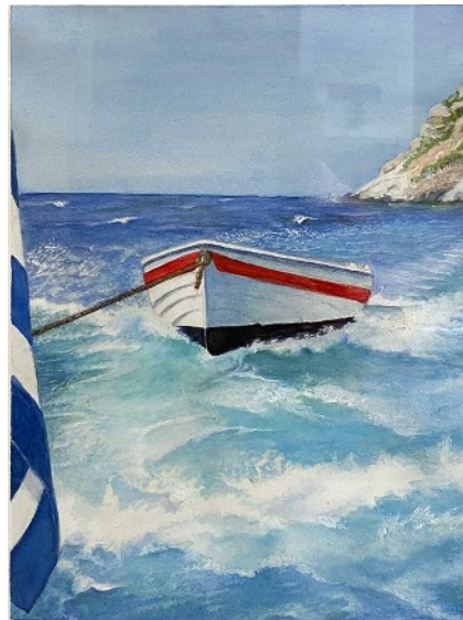
1 Wendy Faulkes