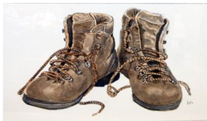
2 Len Hodge