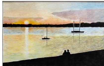
2 Bert Griffin