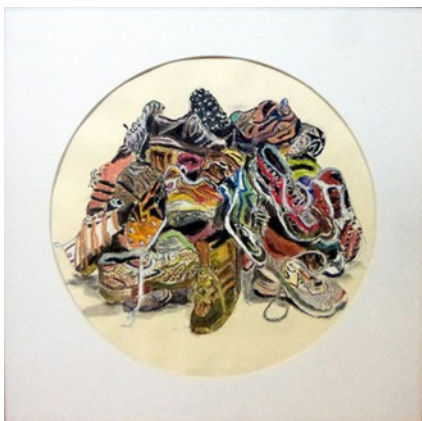
3 Len Hodge