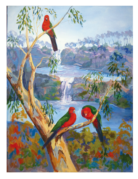
1 Yvonne Biggs