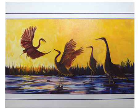
2 Yvonne Biggs