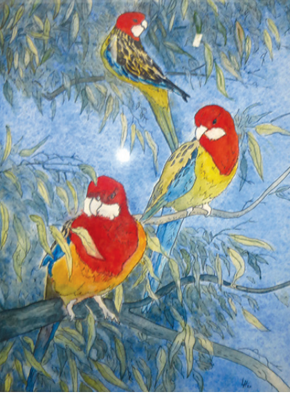
3 Len Hodge