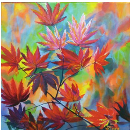
3 Yvonne Biggs