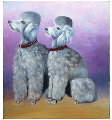
3 Yvonne Biggs