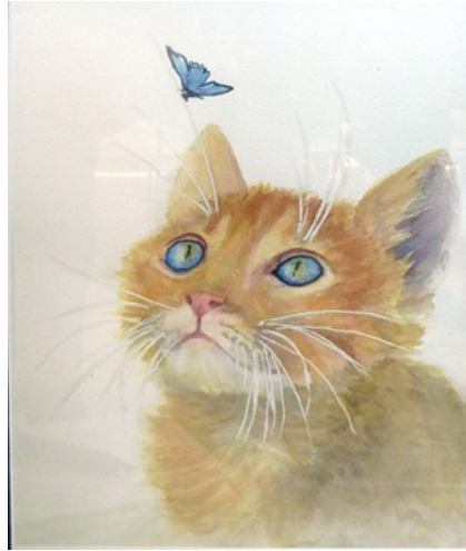
2 Sandra O'Connor