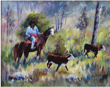
1 Adele Wright