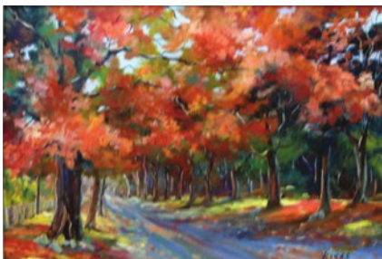
1 Yvonne Biggs