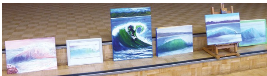
Sample of results from How to paint water lessons