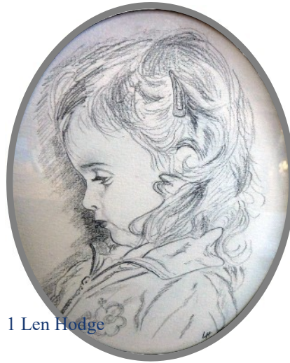
1 Len Hodge