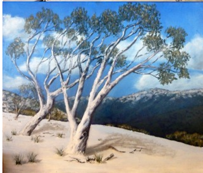
2 Ian Foreman