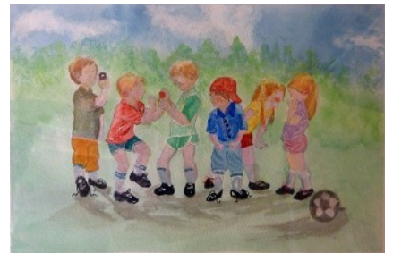
2 Lorraine Francalanza