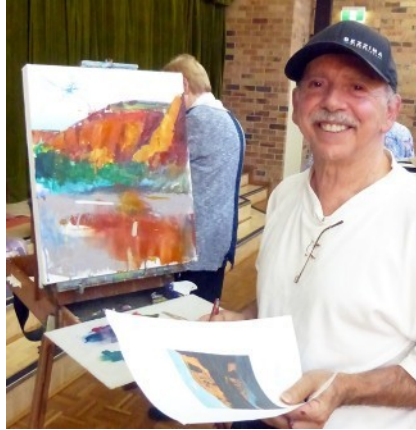
Instagram : bezzinaart