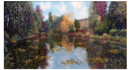
1 Ian Foreman