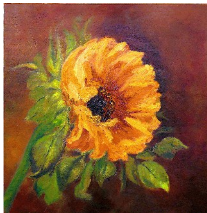
2 Myriam Pulgar