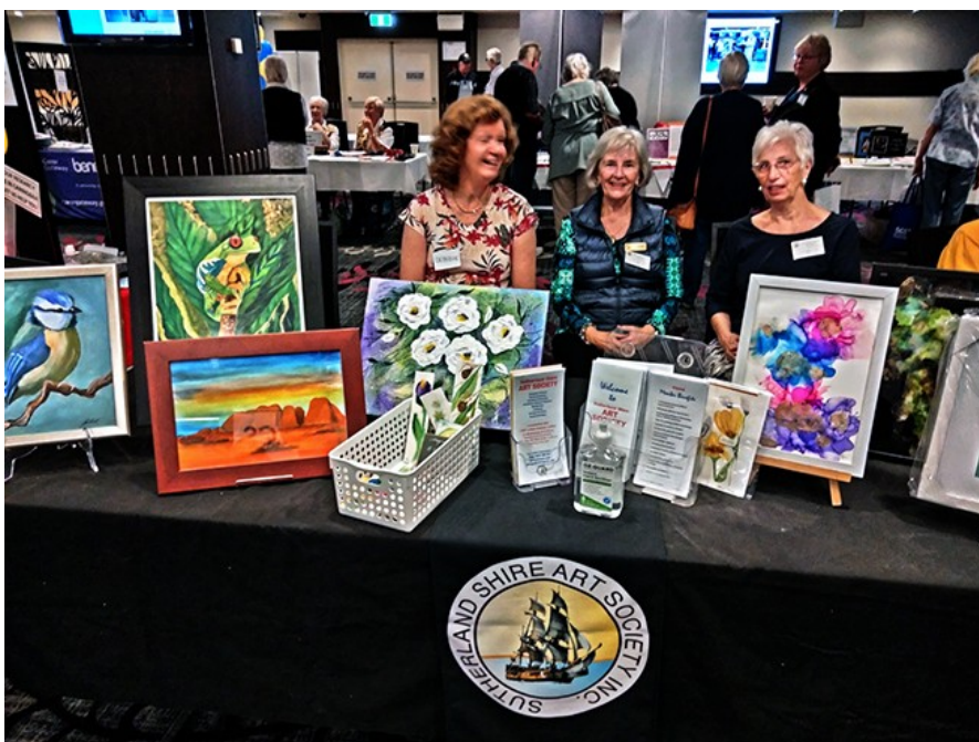
SSAS table at Seniors Fair at Gynea Tradies

Peoples Choice Child/Children Demonstrator: Joe Bezzina