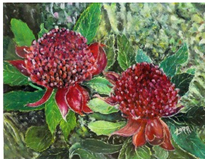
1 Pat Zoppi