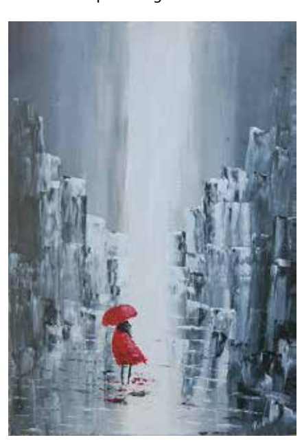
Kaye Thistlewaite • Lady in Red