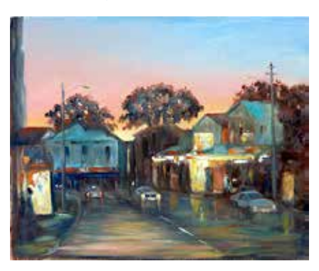
Helen Squire • Night Street Scene